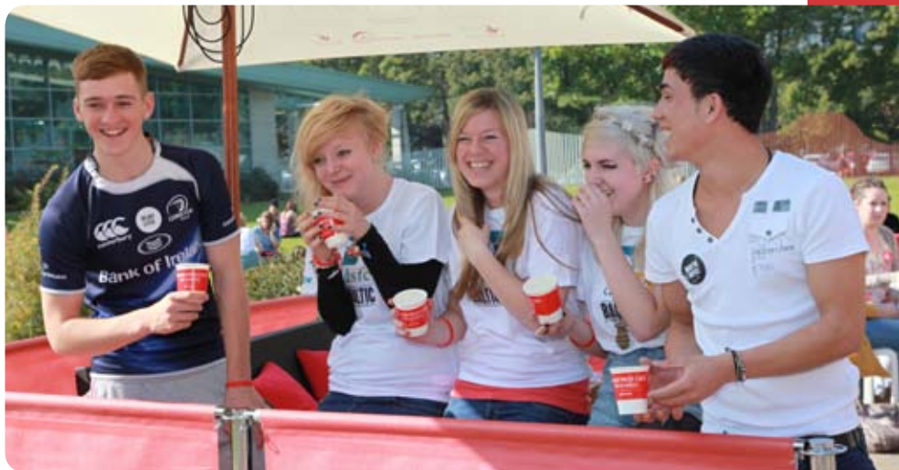
Above: Durham Sixth Form Centre students at the Turner Prize café outside the Visual Arts Centre.

The Visual Arts Centre provides a bright, inspirational setting with first class facilities to support study and creativity. Our dedicated arts staff are engaged in their own arts practice and are currently undertaking postgraduate, doctorate and personal studies, creating a valuable and inspiring team of professional artists and designers.